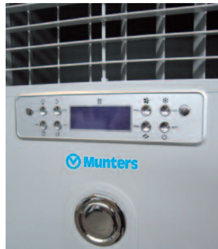
Close up of the display with different running features.